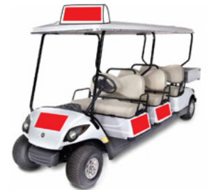
Outside Golf Carts