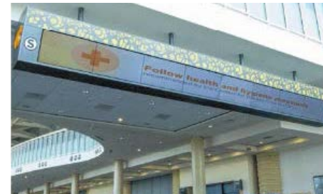
Logo branding on 12 digital screens throughout the OCC