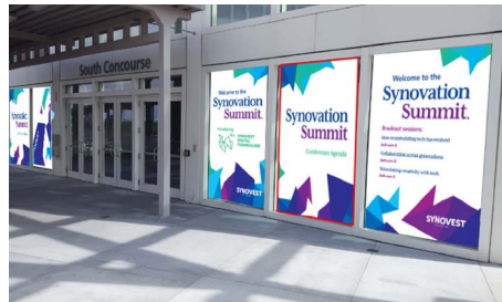
South Concourse Bridge Entrance