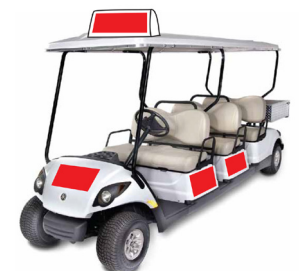
Outside Golf Carts