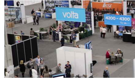
Overhead Hanging Booth Banner