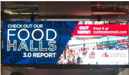
Logo branding on 14 digital screens throughout the LVCC

Receive maximum visibility with a stunning video advertisement that will run and rotate for the duration of the event.