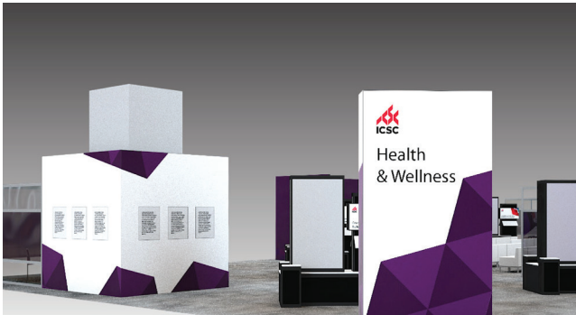
Photo may not be an exact rendering.