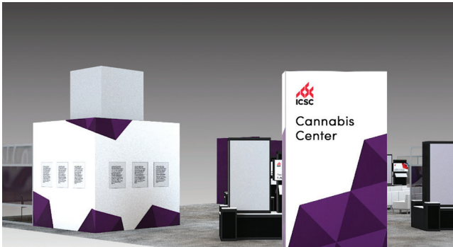
Photo may not be an exact rendering.