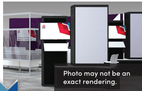
Photo may not be an exact rendering.