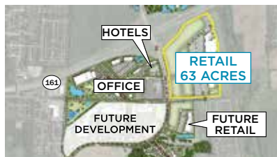
HAMILTON QUARTER Columbus, OH

50-acre mixed-use project with grocery-anchored retail, medical, hotel and outlots in the center of fast-growing master-planned community.