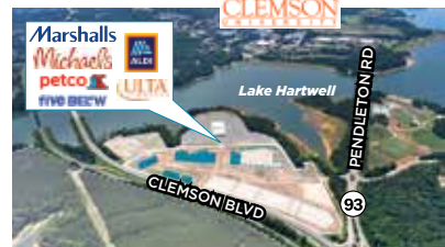
HARTWELL VILLAGE Seneca/Clemson, SC

New 200-acre mixed-use development at SR-161/Hamilton Road interchange to include 1,000,000 SF Retail, Restaurant & Entertainment, 600,000 SF Office, and 200-room Hotel.